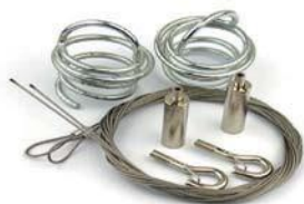
Installation Method 1: ISpring Anchor Fixture Kit Suspended from soffit